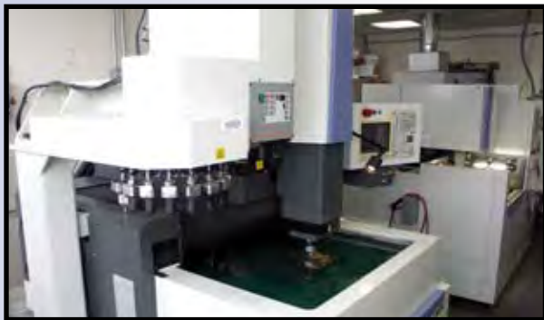
On Site Tool Room- EDM