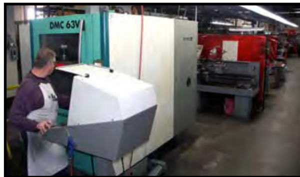
On Site Tool Room- Vertical Machining Center