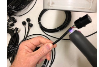
Plasma Treatment Station